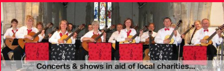
Concerts & shows in aid of local charities...

We have booked HAGO to perform a concert for us on Saturday 1st March 2014 .