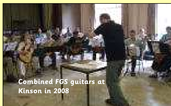
Combined FGS guitars at Kinson in 2008

Highlands Village Hall, 5 Florey Square, Winchmore Hill, London, N21 1UJ. For all DGS members who wish to participate. Large group sessions conducted by Cornelius Bruinsma