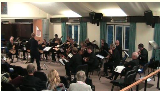
The Orchestra performing Peter's Suite