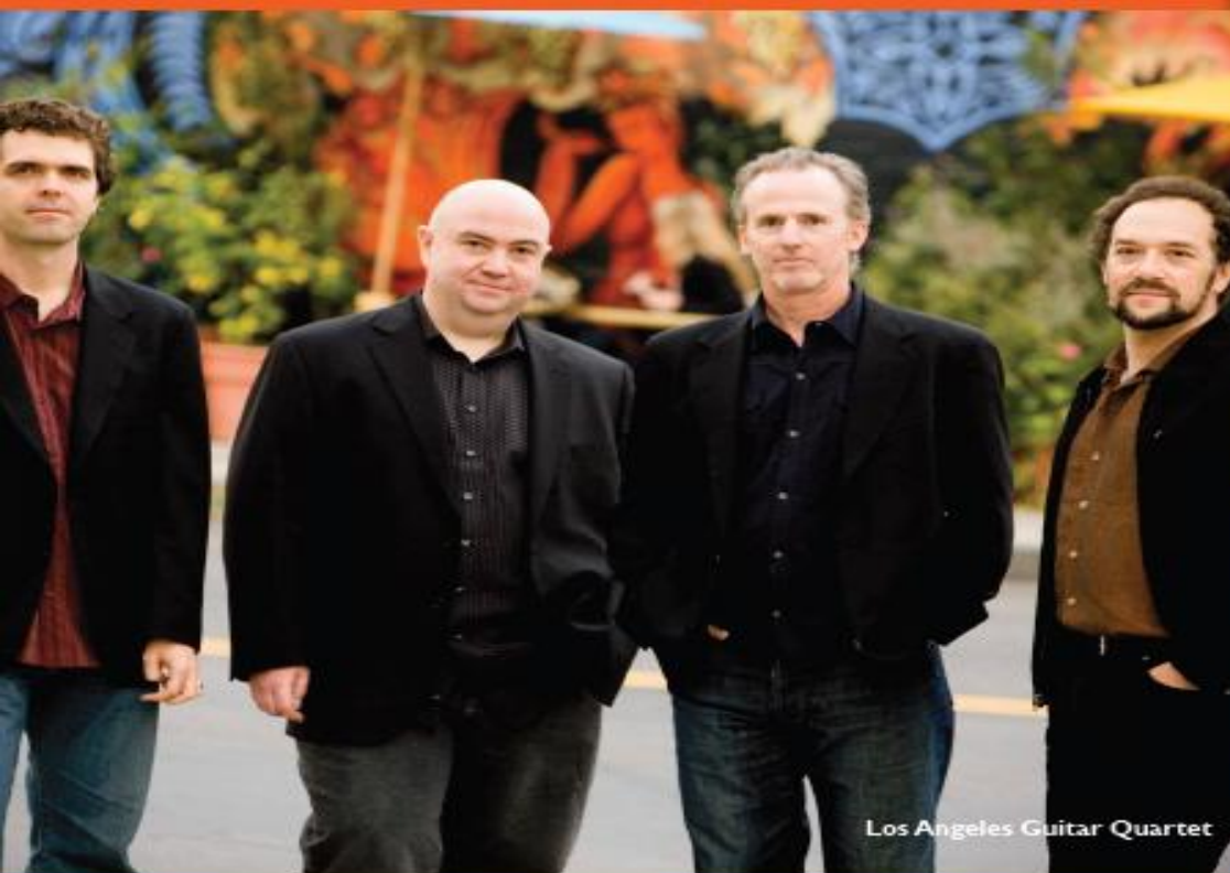
Los Angeles Guitar Quartet

Featuring a host of top international guitarists including Grammy award winning Los Angeles Guitar Quartet