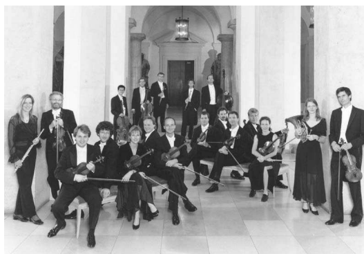
Bavarian Radio Symphony Orchestra